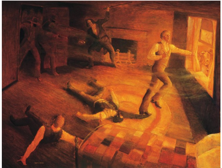
Martyrdom of Joseph & Hyrum.

"I was back in Kirtland, Ohio, and thought I would take a walk out by myself, and view my old farm, which I found grown up with weeds and brambles, and altogether bearing evidence of neglect and want of culture. I went into the barn, which I found without floors or doors, with the weather-boarding off, and was altogether in keeping with the farm.