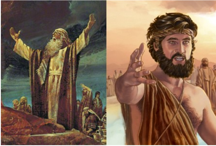
Elijah & John the Baptist were the same spirit in different bodies. 7

Eternal Round. There are several articles on my website explaining the basic concepts and how it has actually been hidden in plain sight in the scriptures. It is an important concept to understand as we enter the Millennium.