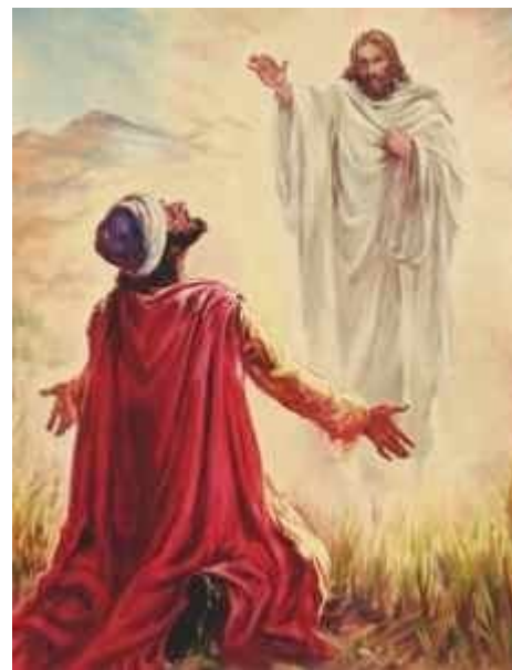
Paul's vision of Christ.

People did not become Christians because the church had a great youth program! They joined when they were personally converted through answers to prayer. But what about Saul? He was not praying to know if Christianity was true, but rather was executing Christians because of what he thought he knew to be true. What converted Saul? It was that he became a witness of the resurrected Christ himself!